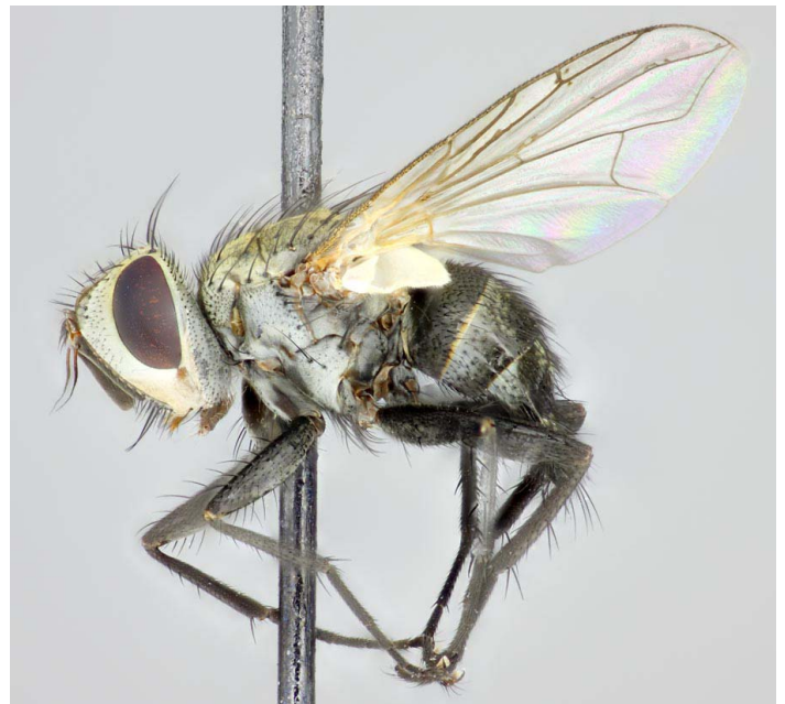
Figure 4. Istocheta aldrichi (Mesnil) from Nepean, Ontario, Canada.

The presence of I. aldrichi -like eggs on the pronota of Japanese beetles is a strong indication of I. aldrichi parasitism but is not definitive proof. One cannot discount the possibility, however remote, that a related blondeliine tachinid is responsible, especially