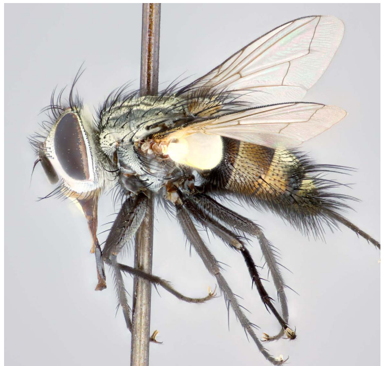
Figure 7. Siphosturmia confusa Reinhard from Tolman Bridge Recreation Area, Alberta, Canada.