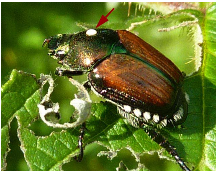
Figure 5. Japanese beetle with tachinid egg (red arrow) attached to pronotum; on raspberry, Nepean, Ontario, Canada.

The sex ratio of parasitized beetles was determined by sexing 32 parasitized beetles collected at random during July 2013. These were easily separated