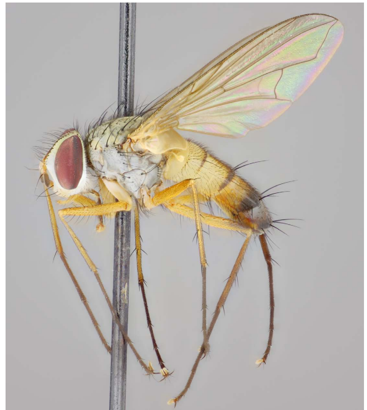
Figure 2. Stomatodexia sp. from Ida Canyon, Huachuca Mountains, Arizona, United States.

2 males: USA, Arizona, Huachuca Mountains, Ramsey Canyon, Hamburg Trail, 31°26.3'N 110°19.2'W, ca. 6300' [1920 m], 11.viii.1999, J.E. O'Hara.