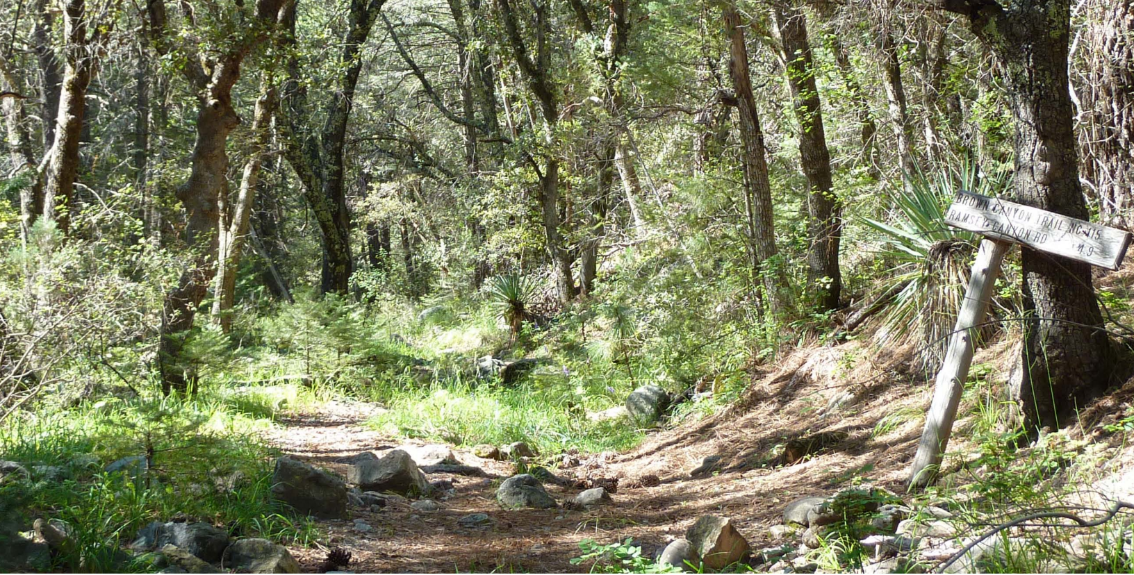
Figure 1. Hamburg Trail in Ramsey Canyon, Huachuca Mountains, Arizona, United States. The two species newly recorded from America north of Mexico, Stomatodexia sp. and Calolydella summatis Reinhard, were found here.