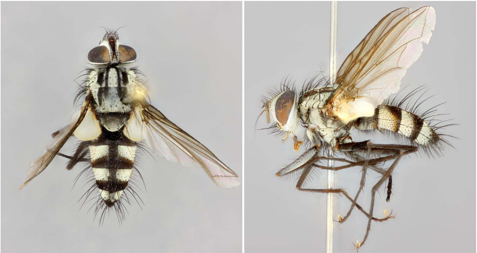
Figure 3. Calolydella summatis Reinhard from 14 mi. SW. El Salto, Durango, Mexico. Left, dorsal view. Right, lateral view.

1 male: USA, Arizona, Huachuca Mountains, Ramsey Canyon, Hamburg Trail, 31°26.3'N 110°19.2'W, ca.